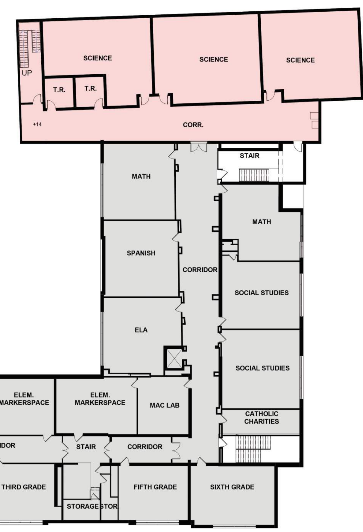
2 SECOND FLOOR PLAN SCALE: 3/64" = 1'-0"