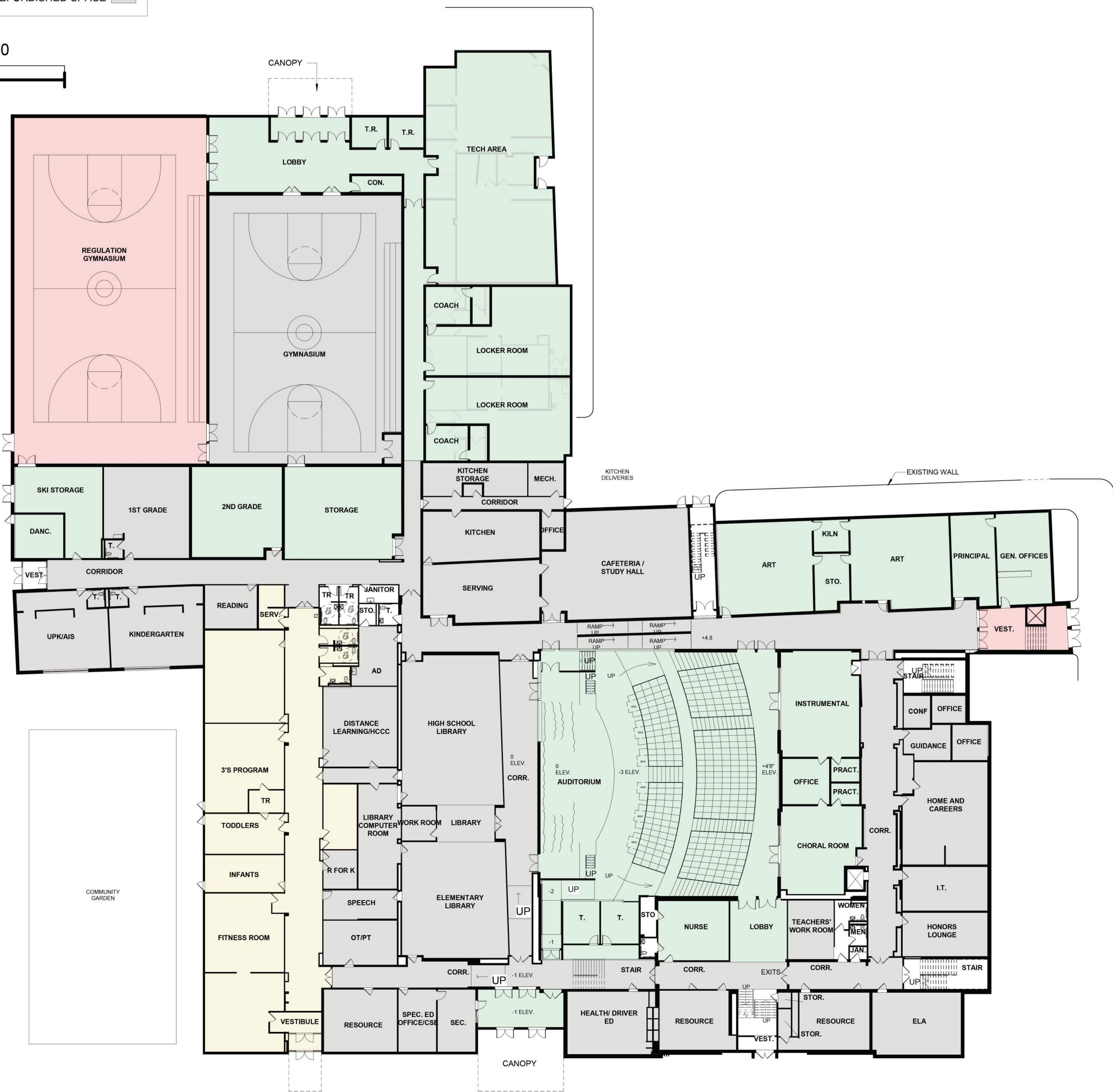
1 FIRST FLOOR PLAN SCALE: 3/64" = 1'-0"